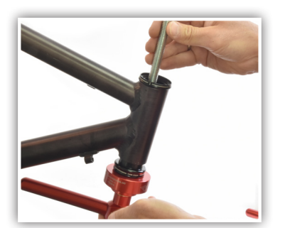
6. Drop second headset cup and drift into frame. Insert handle and rod assembly.