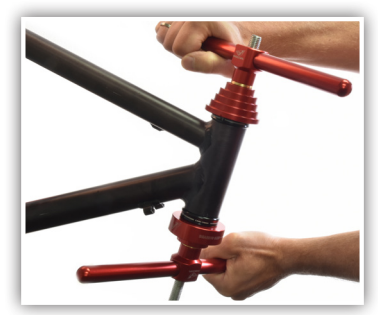
Turn handles to fully press second cup into frame. Check that headset cup is completely pressed into headtube.

Continue headset installation according to manufacturer's instructions and specifications.