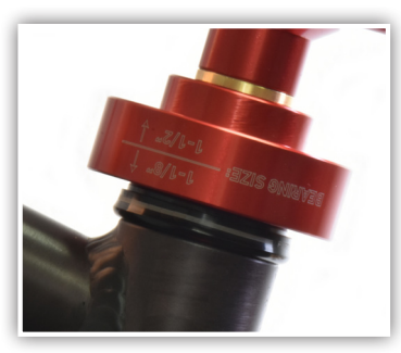
5. Check that headset cup is completely pressed into headtube. Remove handles, drifts and rod from headset assembly.