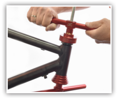
Thread on second handle and turn handles until first headset cup is completely installed.

Insert rod and handle through drift. Drop Headtube Drift onto rod and into headtube. Drift should fit into headtube with a small amount of play.